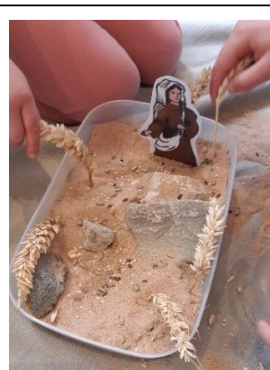
Last week's Godly Play: The Parable of the Sower

You might also like to explore the links on our <u>Children & Young People</u> page. There's a <u>printable sheet</u> which offers a prayer/activities that will help young people get to know the person of Jesus. This week's is based on today's Gospel reading.